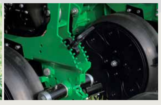
Easy and quick adjustment of sowing depth