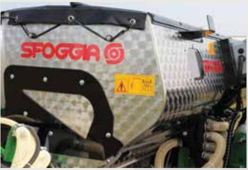
Stainless Steel Fertiliser Hopper of 900 liters, with volumetric distributors Sfoggia