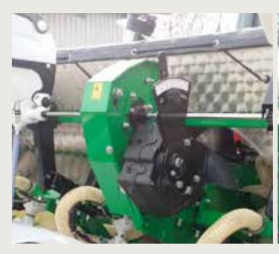
Microgranulator drive transmission version Plus, with 3 cams variator