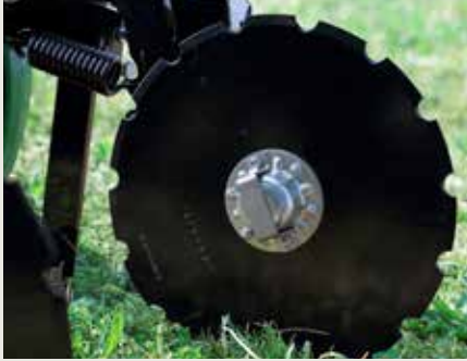
Fertiliser Double Disc, mounted directly on the plating unit for a constant distance of fertilizer deposition compared to seed position