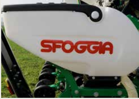
Seed Hopper of 58 liters. Versions of 30 liters are also available.