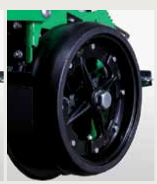
Large rubber spoke wheels 400x115