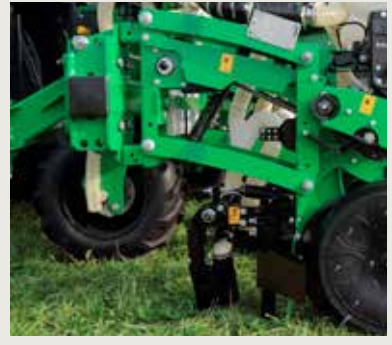
Fertiliser Coulters, directly mounted on the sowing planting unit for a constant distance of fertilizer deposition compared to seed position