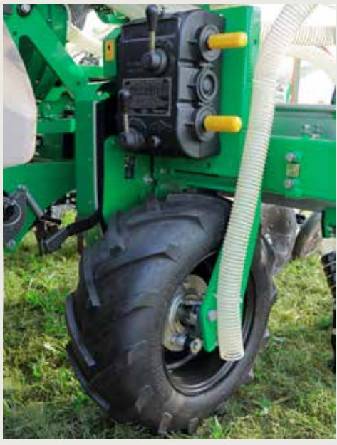
Front Drives Wheels, Gear- Shift Lever, Easy and Quick tractor range shift.