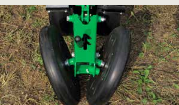
Easy adjustment of back wheels pressure