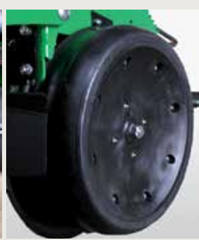
Large rubber depth wheels 400x115 Available in tight version 400x60