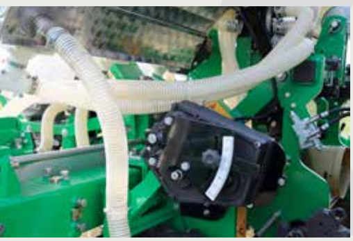
Fertiliser drive transmission Version Plus, with 3 cams variator